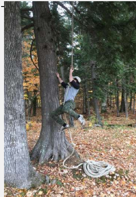
The obstacle course!

Although in competition for first place, they cheered each other on! (Even to the point of running alongside in case someone needed a sub.)