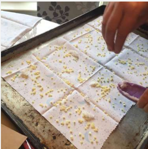
~busy little bees making "green" saran wrap~