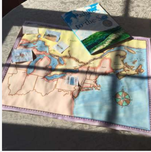
~paddling to the sea~