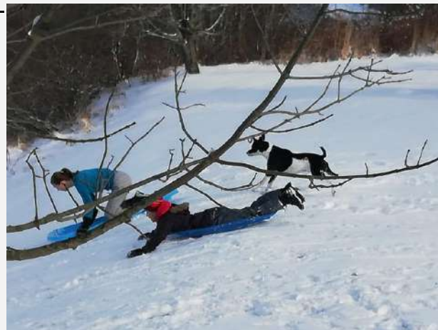
~in the comfort and convenience of your own backyard!~