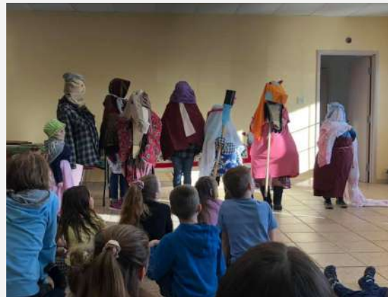
~mumming, Christmas in Newfoundland~